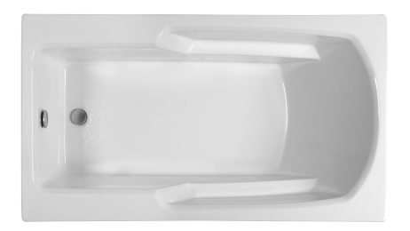
Features integral armrests.